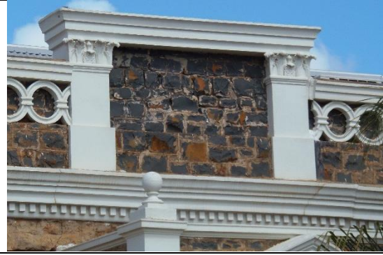
Stone pediment