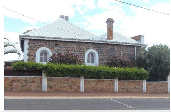
East Façade Source: Stephen Carrick Architects October 2021