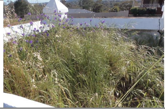
Inside the monument