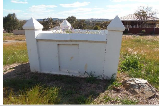
Rear of Monument