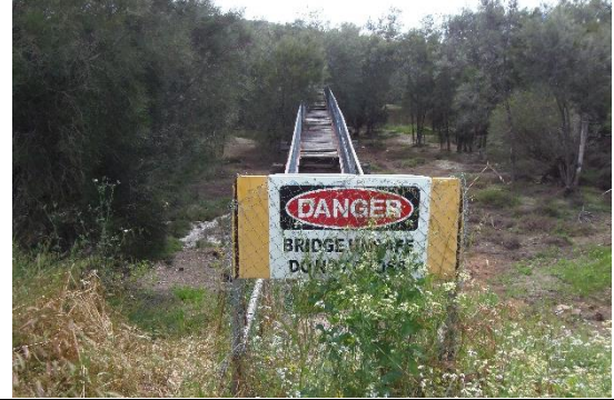
South end