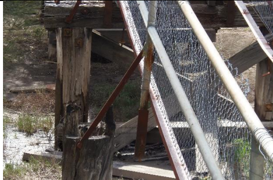
Damage to timber pillars