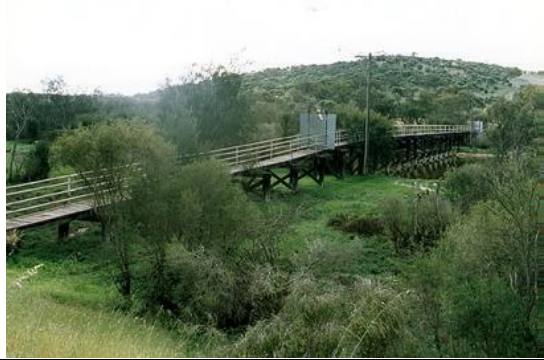
View from South end