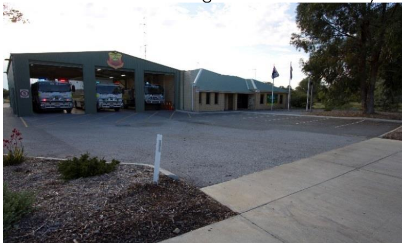
Quinns Rock BFB with a 12.2, ICV and 3.4U and LT (out the rear)

As yet there is no facilities that could be utilised for the brigade. A funding application could be approved by DFES for the new brigade facility (similar to the one shown below) but in the interim the brigade could be run from any of the Shire's sporting facilities or Shire Depot with approval and could utilise surrounding bushfire vehicles for training such as Grass Valley and Irishtown.