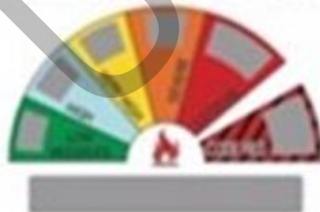
CODE RED EFDRS - Victoria