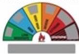
CATASTROPHIC EFDRS All States (excluding VIC)

BARTCO uses standards to develop, engineer, and manufacture from an ISO 9001:2000 certified manufacturing facility located in Australia.