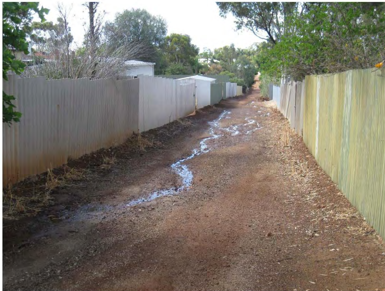
Laneway 8 – Site Inspection Photograph